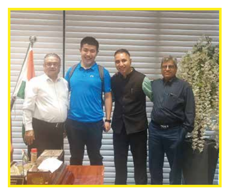
Beijing Luckystar Co. Ltd.