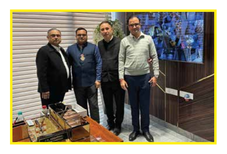
Nagarjuna Fertilizers & Chemicals