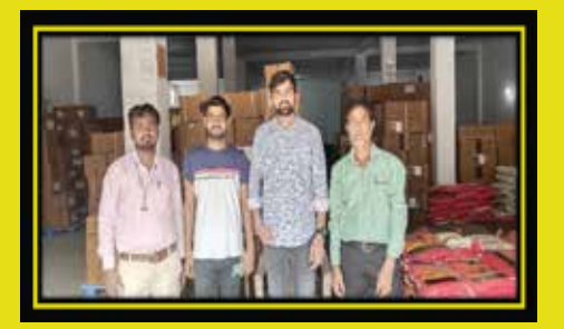
LUCKNOW DEPOT AUDIT DAY