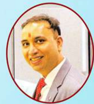
Chief Operating Officer HPM Chemicals & Fertilizers Ltd.

In the spirit of continuous improvement, any constructive input on streamlining the bulletin is very welcome.