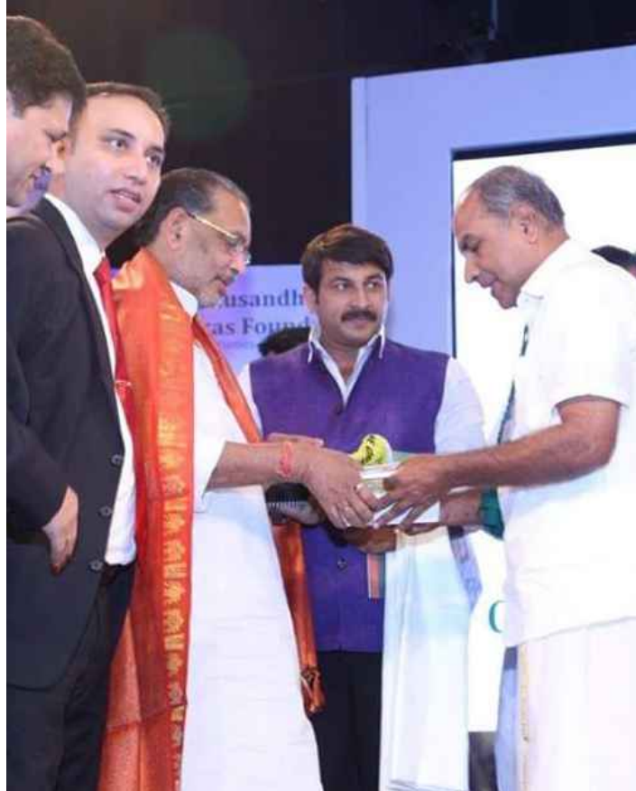
Played Pivotal Role In Crystal Agri Award At Indian Habitat Center By Calling Mps And Agriculture Minister Mr. Radha Mohan Singh