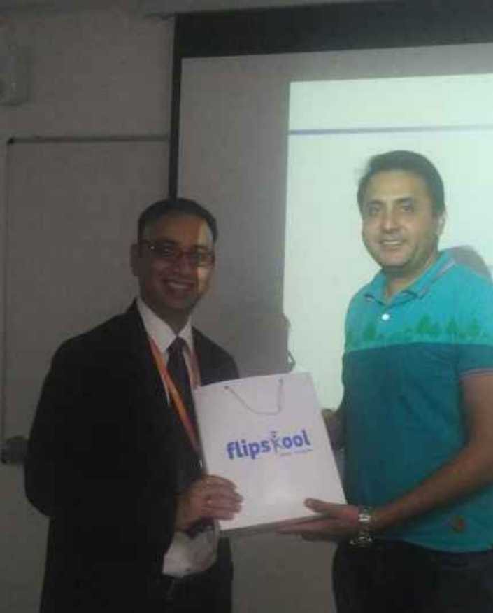
Imparting Knowledge about supply chain S & OP Process to Flipkart Team In Bangalore.