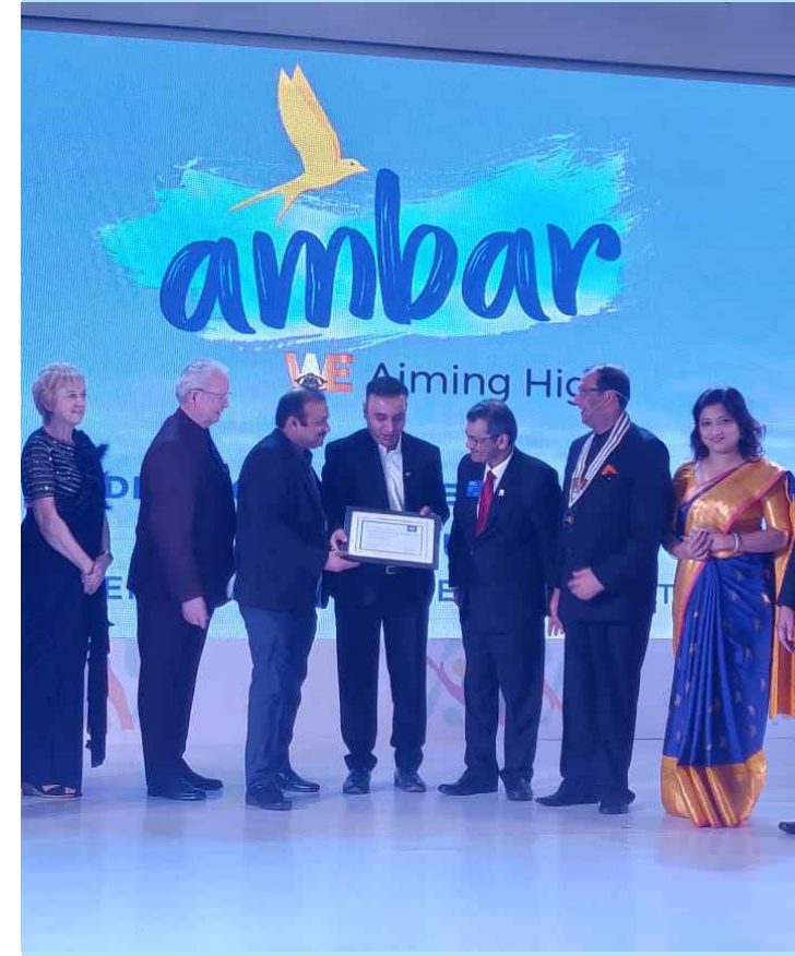
Receiving The Charter As President Elect For Rotary Club Hindon Ghaziabad